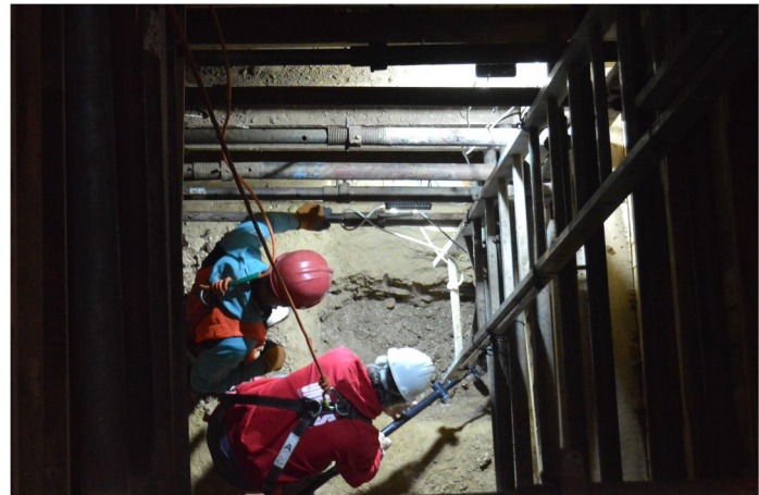
UNMAS Chief of Operations checking the ground for metallic contamination during excavation, in Rafah, Gaza, Palestine, January 2023.

In January 2023, UNMAS worked diligently to excavate a DBB in a poultry farm located in a densely populated area in Rafah, in southern Gaza. After UNMAS declared the site safe and confirmed it was clear from any known explosive hazards, the poultry farm owner restored his land, resumed his business, and re-employed the workers.