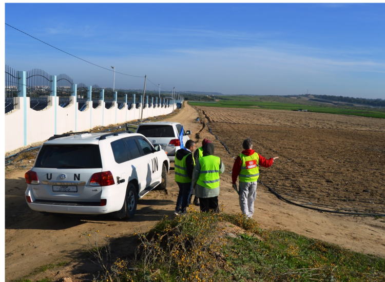
UNMAS Operations personnel conducting a risk assessment with G4G project staff in Gaza, January 2023.

UNMAS Palestine plays a vital role in facilitating humanitarian and development projects by providing risk assessments, explosive ordnance disposal (EOD), and explosive ordnance risk education (EORE).