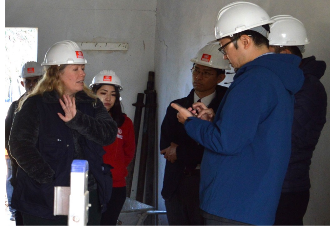
UNMAS Head of Projects Unit briefing the Japan delegation on UNMAS operations in Gaza.

UNMAS explained the impact of explosive remnants of war on civilian lives, the scale of the problem, and the technical processes for removing these types of explosive ordnance as well as the current and future needs and priorities of UNMAS.