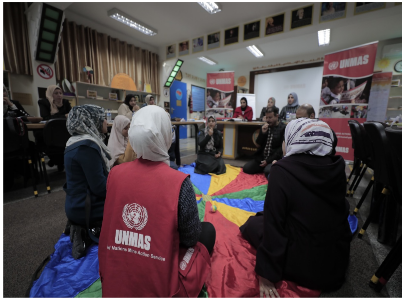
EORE TOT participants attempting stress release techniques led by UNMAS EORE Officer, January 2023, Gaza, Palestine.

Explosive ordnance risk education (EORE) is necessary for saving lives, avoiding injuries, and reducing psychological trauma resulting from exposure to explosive hazards.