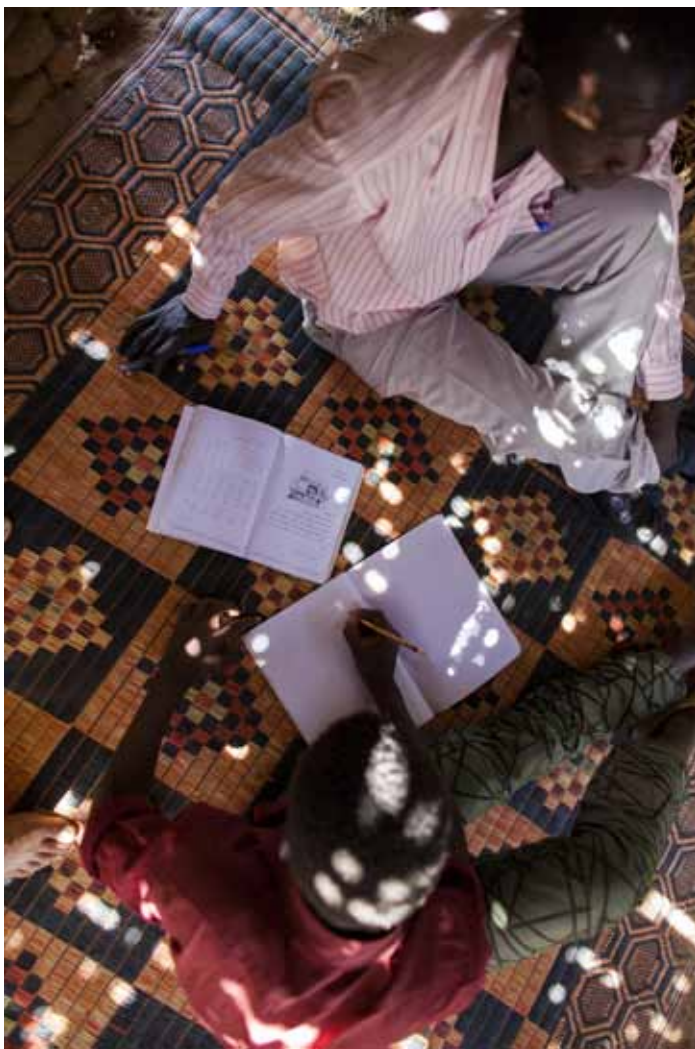
Far Left: On 26 July 2009 near El Fasher, North Darfur, 25 child soldiers begin the formal process of disarmament, demobilisation and reintegration.