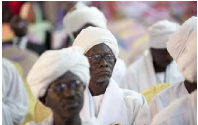
On 19 November 2013 in Nyala, South Darfur, UNAMID held a workshop, the third in a series that the Mission is organising, to find a solution to the tribal conflicts in the area.

The JSR expressed concern about the tribal violence that has affected the civilian population and has contributed to an increase in the