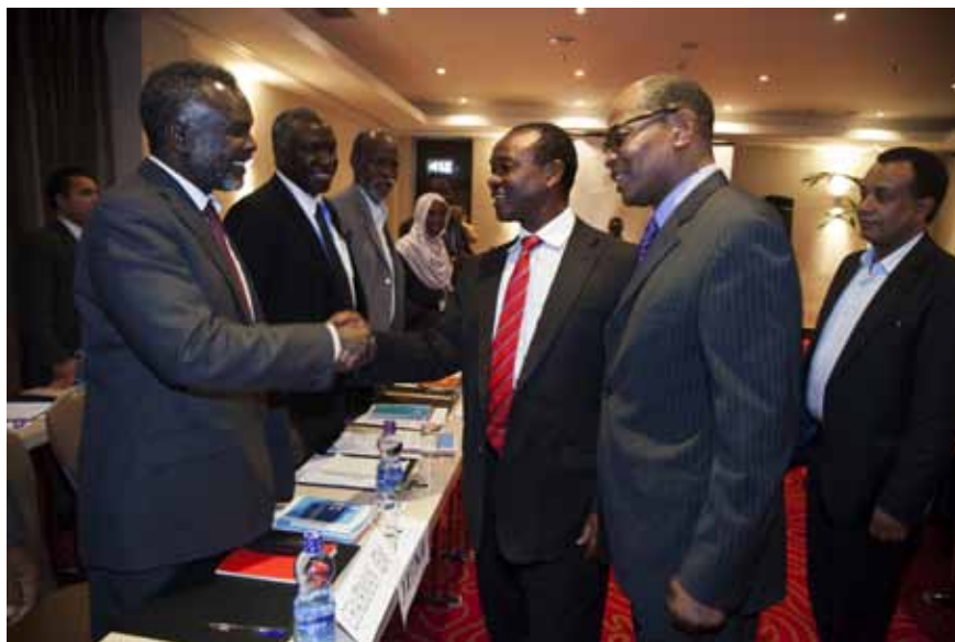
On 10 December 2013 in Addis Ababa, Ethiopia, African Union Commission Deputy Chairperson Erastus Mwencha (centre), greets Mr. Gibril Ibrahim (left), leader of the Justice and Equality Movement, with the presence of AU-UN Joint Chief Mediator Mohamed Ibn Chambas (right), during the second day of a workshop to discuss peace in Darfur.

As part of this ongoing international engagement, Dr. Chambas, who also doubles as the United Nations and African Union Joint Chief Mediator for Darfur, hosted in 2013 a retreat at UNAMID's headquarters in El Fasher for Special En-