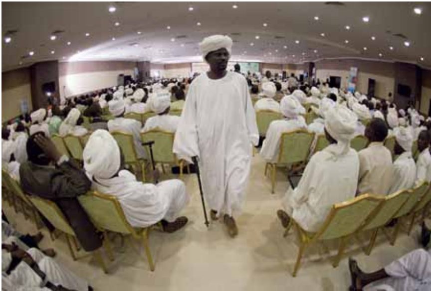
On 25 March 2013 in Nyala, South Darfur, 600 internally displaced people, including refugees, take part in a conference organised within the framework of the Doha Document for Peace in Darfur to ensure that the concerns of displaced people and refugees are addressed, and to solicit recommendations for the Doha Donors Conference.

In a press statement following the Addis meeting, both JEM-Gibril and SLA-MM emphasized the importance of such meetings in paving the way to a lasting peace. In their statement, the two movements expressed their commitment to respect and promote the principles of international humanitarian law and human rights.