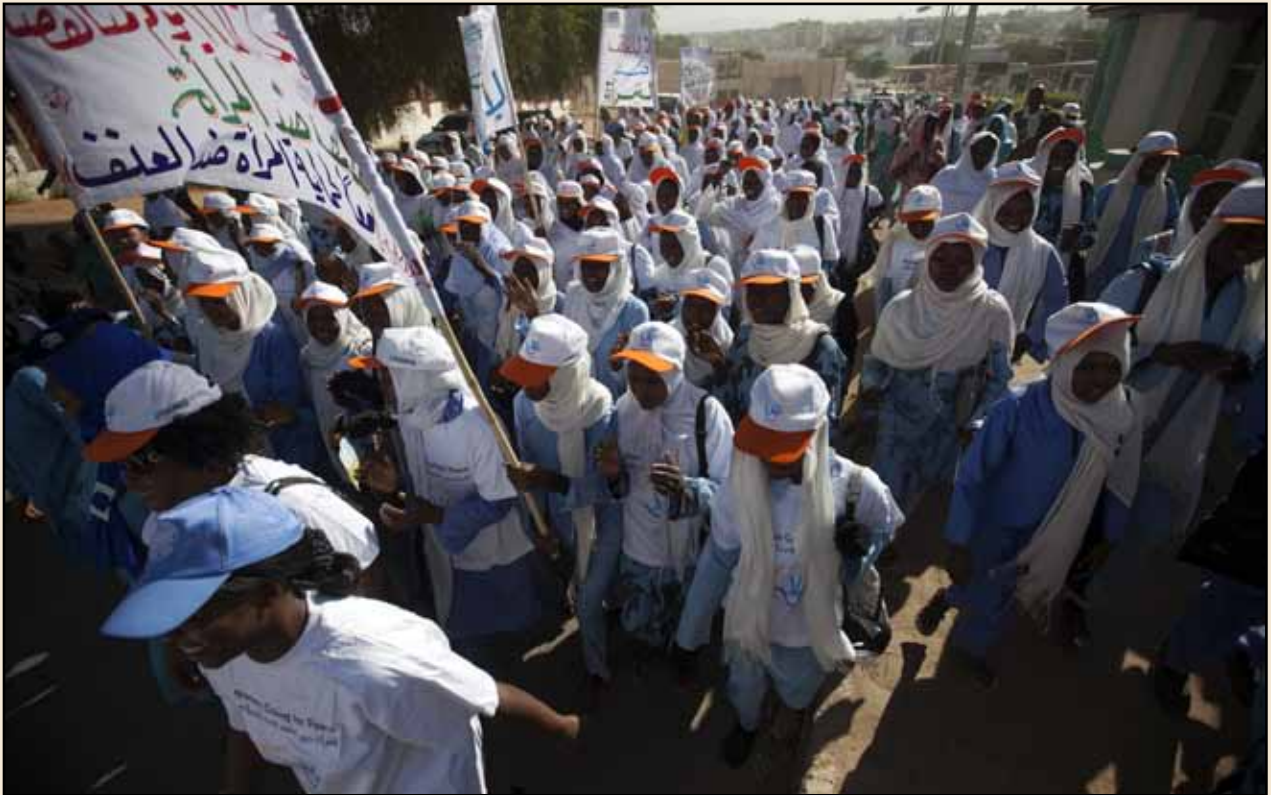
On 5 December 2013, UNAMID staff members, students and residents from in and around El Fasher march to commemorate 16 Days of Activism Against Gender Violence in an event organised by UNAMID.