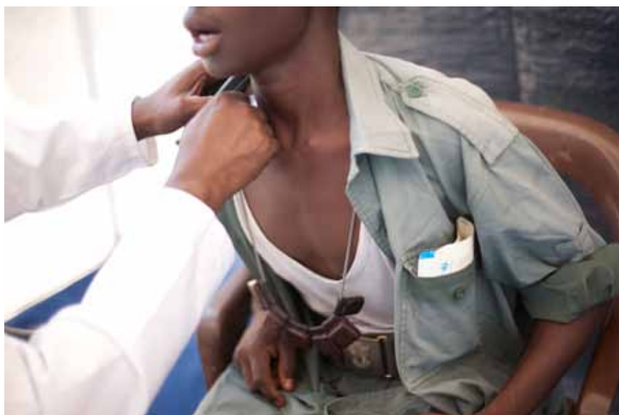
On 12 August 2009, UNICEF and UNAMID successfully complete a children’s disarmament programme in Kafod, North Darfur, in a ceremony attended by armed movement commanders as well as Sudanese and foreign officials.

Competition over access to the educational services that are offered has been a