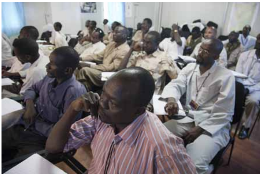
On 20 September 2012 in EL Fasher, North Darfur, field commanders of the Liberation and Justice Movement participate in a workshop session on child rights and child protection conducted by UNAMID's Child Protection component.

due to verifications, and can take up to two or three years," he explains.