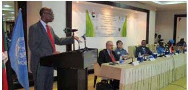
On 27 November 2013 in Khartoum, Sudan, UNAMID Deputy Joint Special Representative Joseph Mutaboba delivers opening remarks ahead of a strategic workshop designed to strengthen cooperation between UNAMID and Sudanese Police.

The event was attended by the Minister of Interior, Mr. Ibrahim Mahmoud Hamed, who said that the goal of the workshop is to help establish peace and stability in Darfur and that the role of UNAMID is to help in achieving this. "Peace will not be realized by increasing military and police troop numbers, but by making peace a culture," he stated.