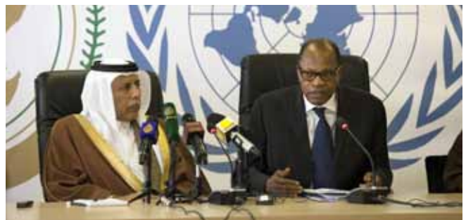
The Deputy Prime Minister of Qatar and UNAMID’s Joint Special Representative address the media following the seventh meeting of the Implementation Follow-up Commission at UNAMID Headquarters in El Fasher, North Darfur.

The JSR went on to highlight the commencement of 315 reconstruction and development projects, in line with the Darfur