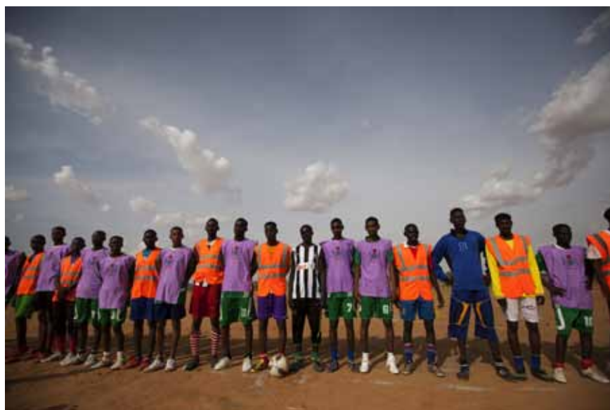
On 3 July 2013 in East Darfur, young people from in and around El Daein (including football players representing displaced communities) stand together for a photograph before playing a match as part of a welcome programme for the visit of United Nations Under-Secretary-General for Peacekeeping Operations Hervé Ladsous.