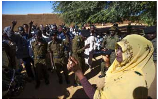
On 17 December 2013, a local singer performs for prisoners and police officers during a ceremony to commemorate the graduation of prison inmates from a skills-training programme at Al Shallah Federal Prison in El Fasher, North Darfur.

As part of the Mission's approach to support peace at the community level, UNAMID's DDR section has been