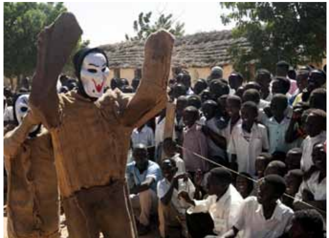
On 10 December in North Darfur, an actor performs a drama presentation in Al Salam camp for internally displaced people during a Human Rights Day celebration.