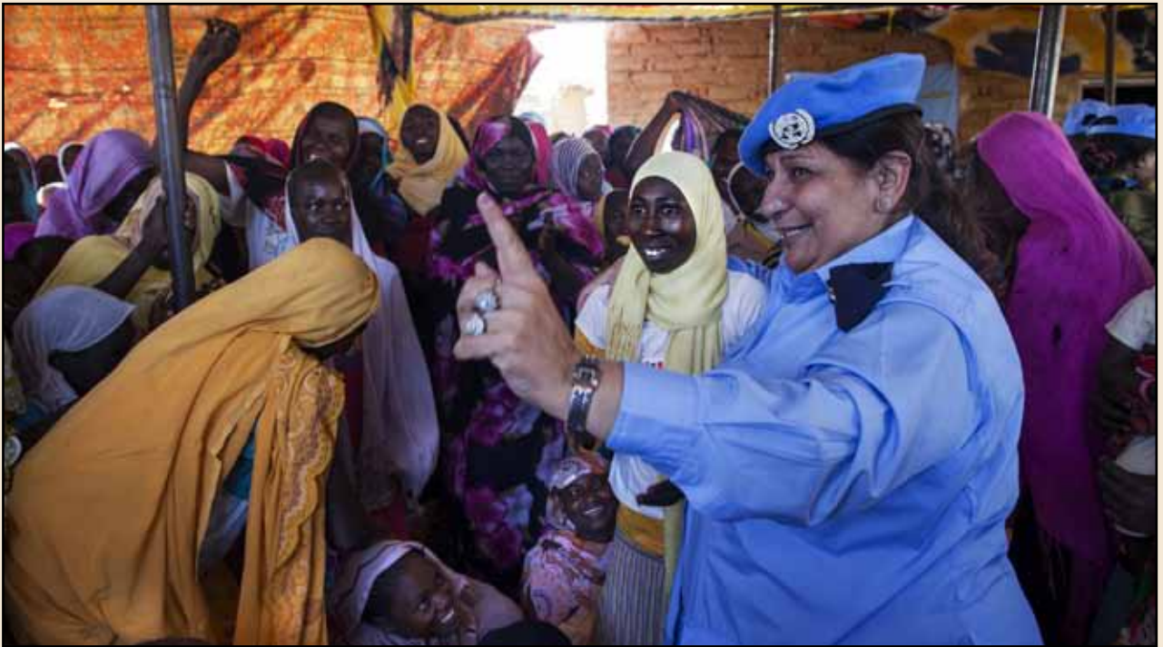
On 14 December 2013, in the Abu Shouk camp for displaced people, a UNAMID Police Advisor celebrates the opening of the Raman Women's Shopping Centre, which was built with the personal support of UNAMID's Police component so internally displaced women can sell handcrafted goods to their community.