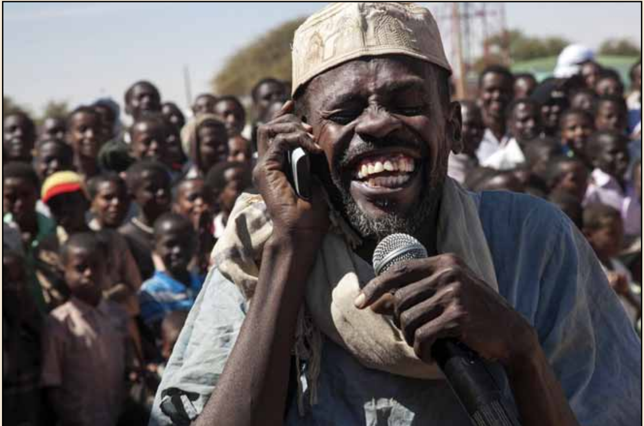
On 12 December 2013, an actor performs a drama presentation to highlight issues related to HIV and AIDS during an event organised by UNAMID and the Sudan National AIDS Control Programme.