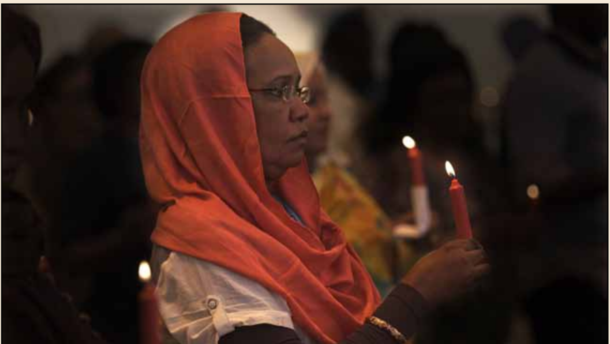
On 1 December 2013, a UNAMID staff member participates in a minute of silence and a candle-lighting ceremony during a commemoration event to mark World AIDS Day at UNAMID headquarters.